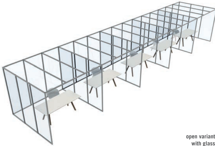
open variant with glass