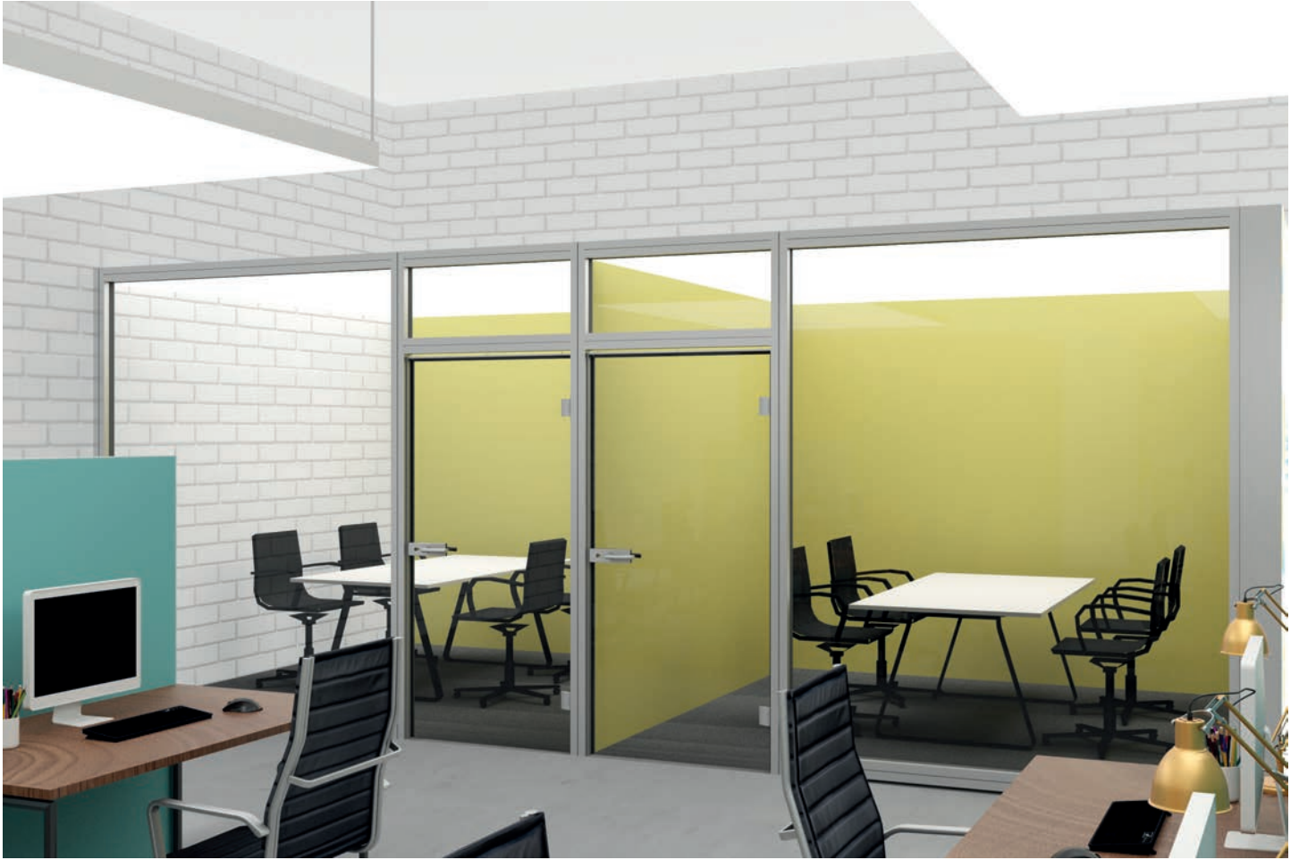
Fully separated rooms offer space for meetings