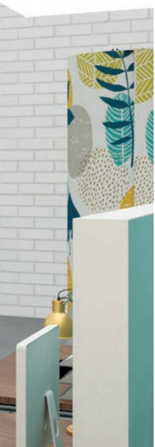
Round ceiling lamps are a perfect fit for individual workstations.