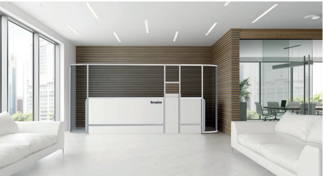
Hygiene protection with functional opening.