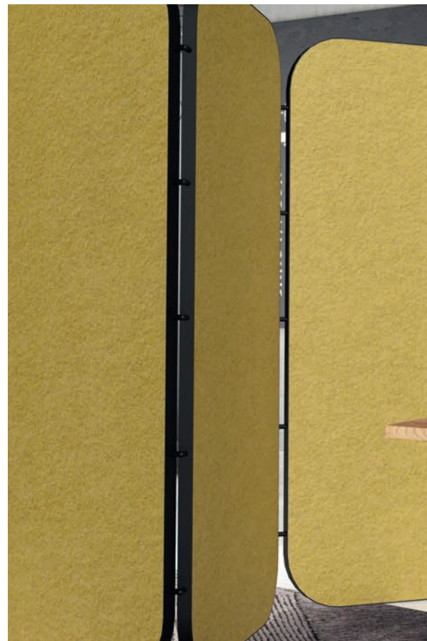
Cladded partition walls for a feel-good atmosphere