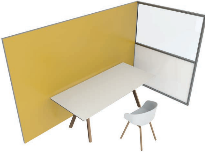
Different materials can be easily combined