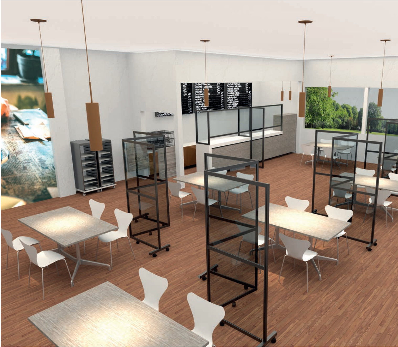
Space dividers allow cafeterias to be used even under strict hygiene requirements.