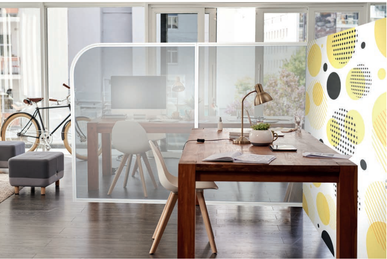
For video conferences: separating workspace from living space