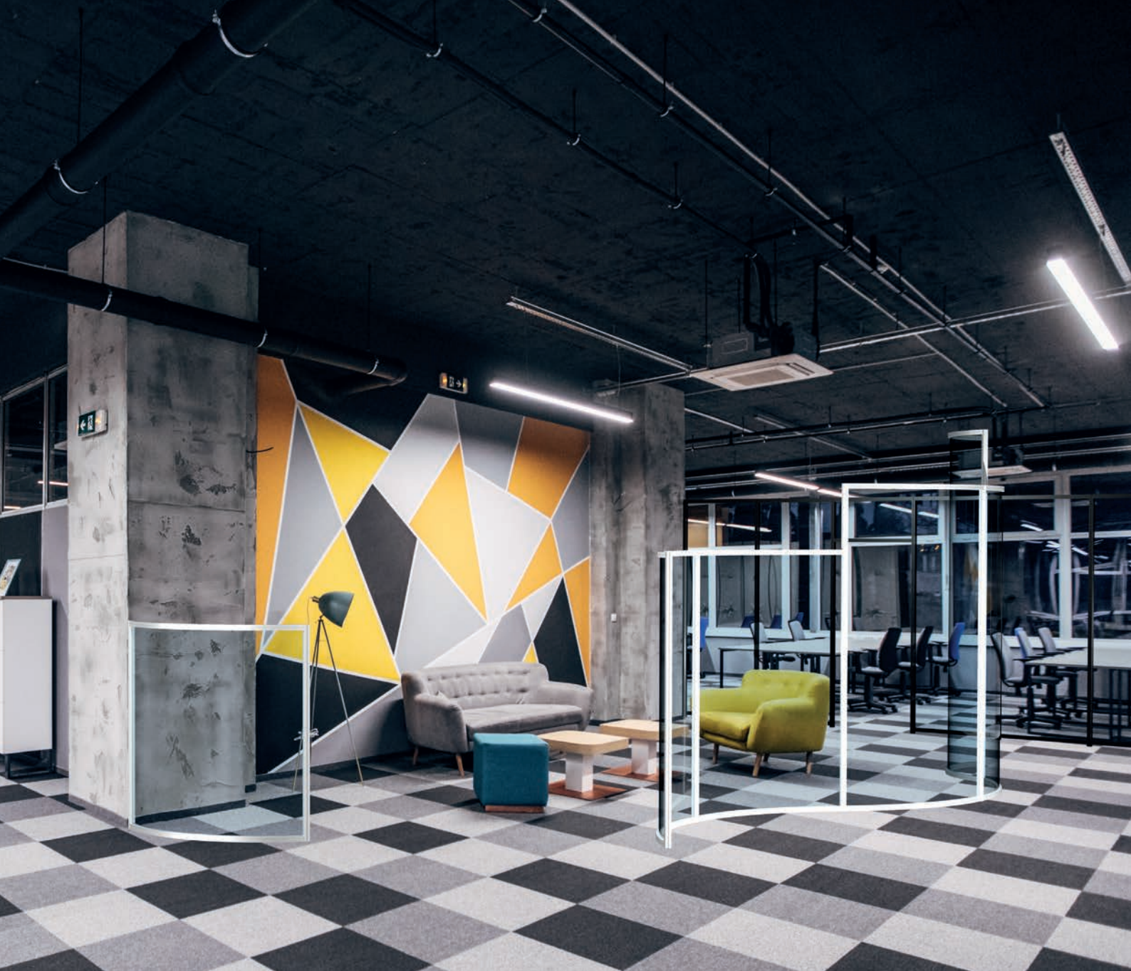
Shielded communal areas