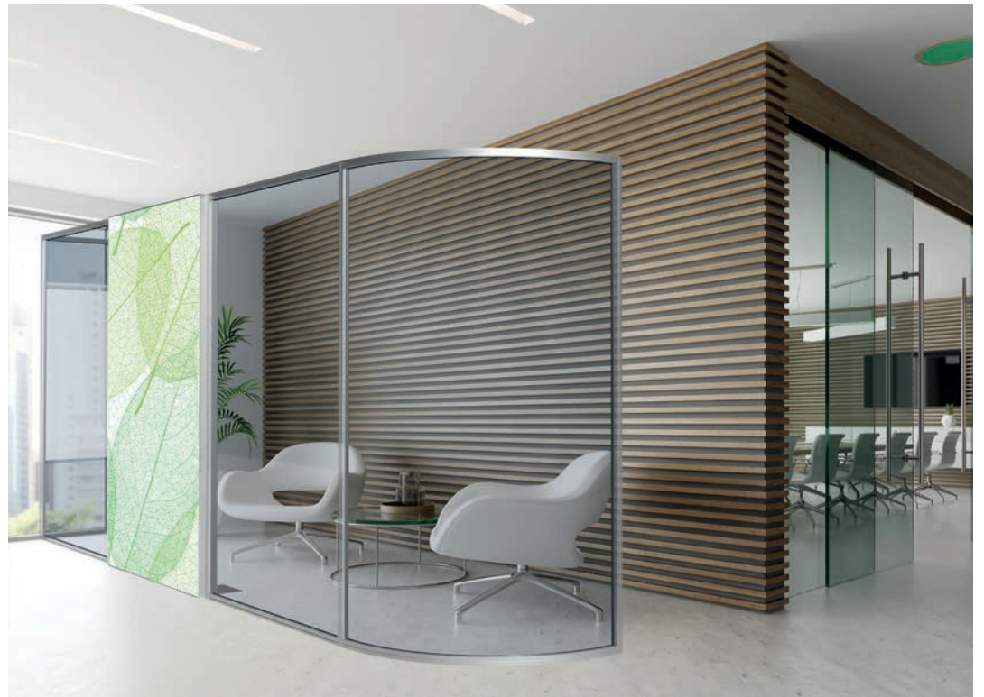
Our modular system constantly adapts to new requirements.