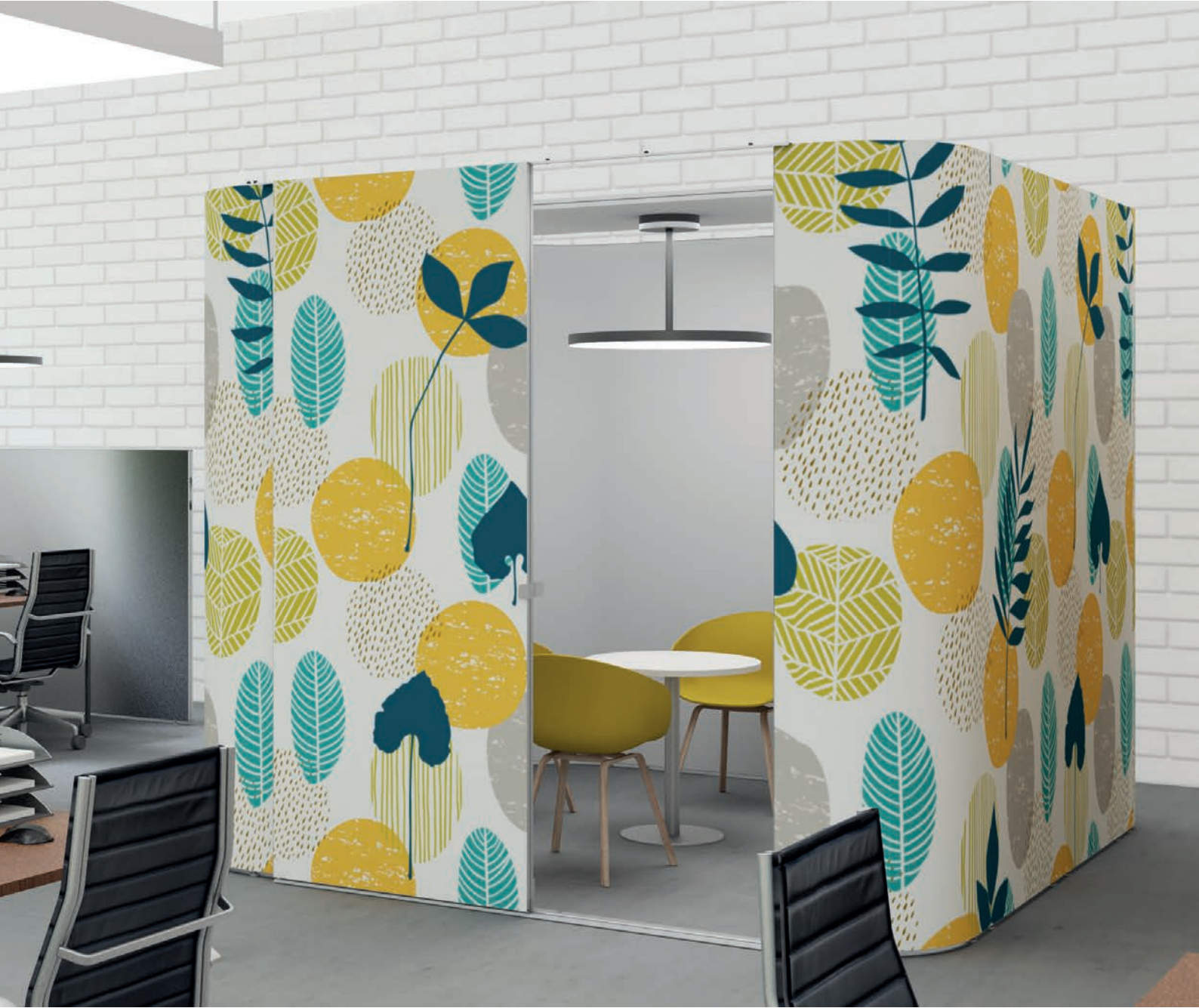
Small meeting room cabins with sliding doors can also be equipped with acoustic fabric.