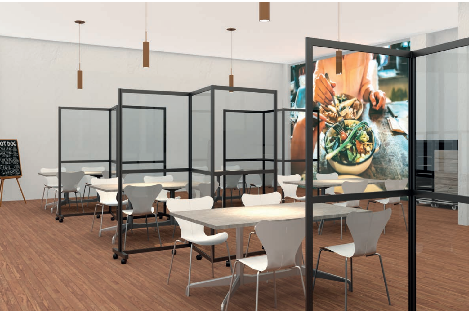
Creating a safe communal area