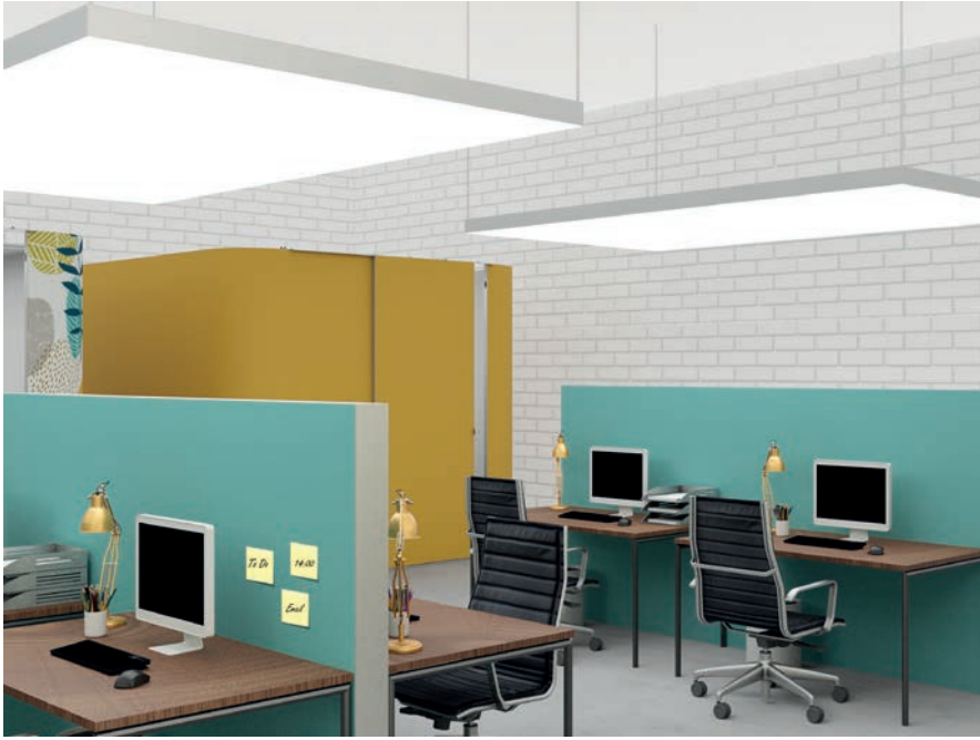
Partition walls create individual workspaces and ceiling mounted light frames provide uniform illumination.